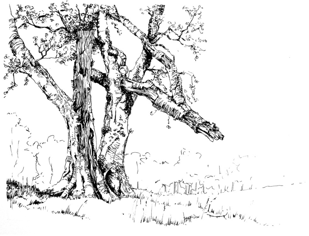
Blown into the arms of another – Jenny Purrett

Using and building on drawing techniques developed on day one, students will work more independently. Through gathering information, collecting found materials and sketching from memory or directly in the field, the day will be spent developing a drawing or series of drawings in response to their experience of the surrounding scenery.