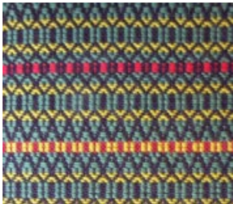
Traditional Icelandic woollen fabric pattern.

Following the issue of the last Newsletter a questionnaire was circulated to all contacts with an interest in the Exports From Iceland Project, to help determine the design brief for the demonstration product.