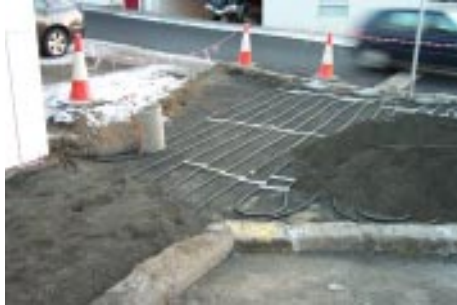
Under-pavement heating under construction.

Geothermal energy is an abundant natural resource in Iceland. It is hard to believe that under the pavements of Reykjavik hot spring water is pumped through a network of pipes to stop them freezing in winter.