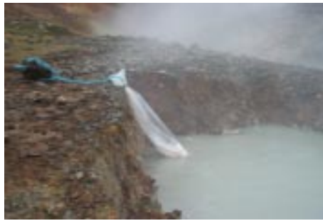
Cooking Chicken casserole in a hot spring.