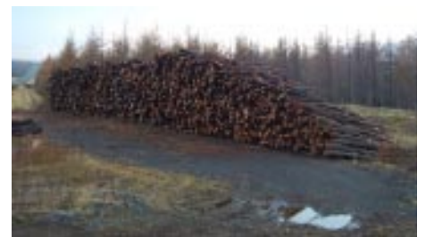
Pile of Forest thinnings, in Egilsstaðir area.

This situation is repeated across northern Europe. But it's in the hands of local artists and craftspeople like Fjorn to demonstrate their skills in finding new ways of making their local resource desirable in changing market economies. If local uses or new products can't be developed from these forest thinnings, who can afford to maintain a financially non profitable woodland? Will the re-establishment of a stripped and neglected ecosystem be sufficient reason to invest in the reforestation of Icelandic hills?