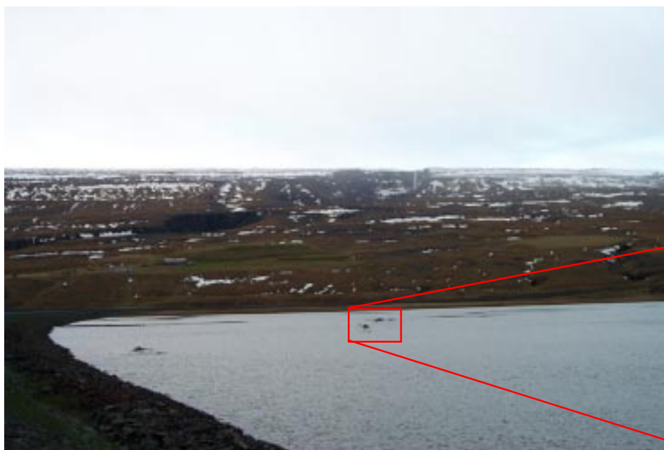
Original picture of lake Lagarfljót

While Tom was going through his photographs from his last research trip to Iceland he came across something quite unexpected. In a picture taken of the landscape in the east of Iceland, there appeared to be something in the water previously unidentified. With some enlargement and enhancement of the original photograph there appears to be a large creature in the water. Tom may have found more evidence to the growing theory that a relative of the Loch Ness monster may be alive and well in lake Lagarfljót.