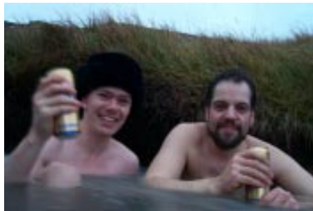
Having a bath in hot stream in the hills.