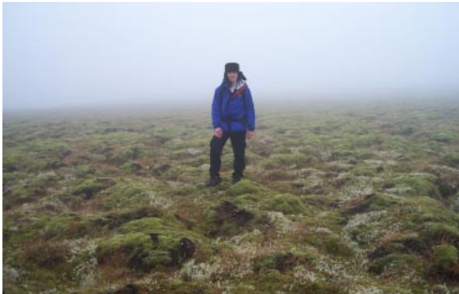
Walking to the hot spring.

Geothermal springs provide a great deal of energy for Iceland's public swimming baths and most homes are heated by a direct supply of hot spring water.