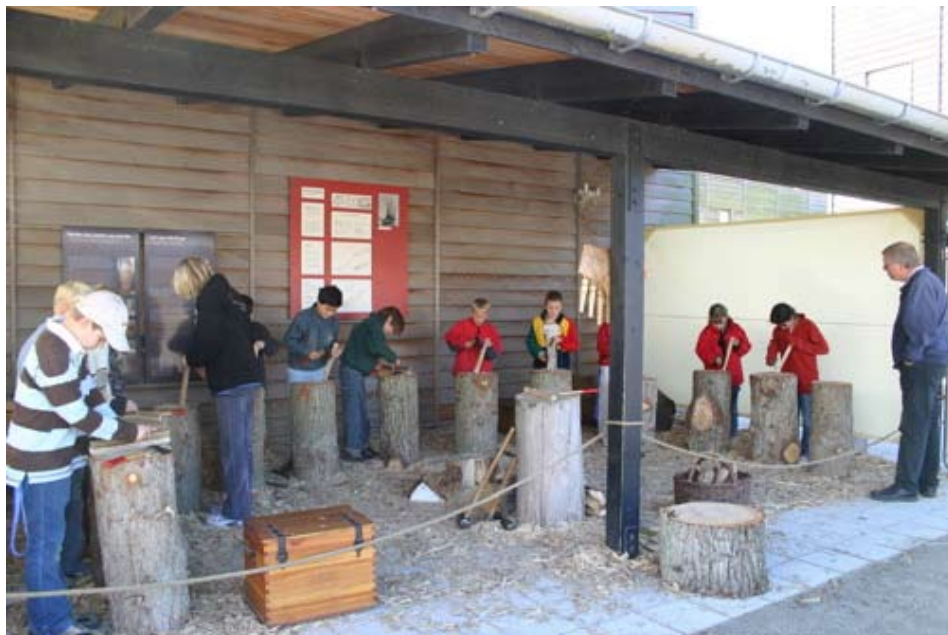
Axe work at Roskilda Viking Ship Museum.

Where are the hands-on experiences for our children?