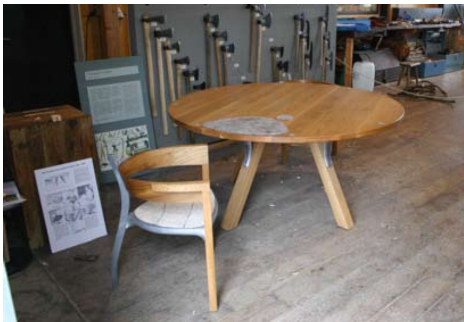
Exhibition at Roskilde Viking Ship Museum.

During the exhibition tour, a survey was conducted on the visitor's response to the dining table and chairs. The raw data from this survey was analysed and the results show that the table and chairs were thought to express Icelandic and Nordic culture well, a mean answer of 4 on a scale of 1(not at all) to 5(very well) was given, and a mean 70% felt that products with Nordic cultural identity had added value.