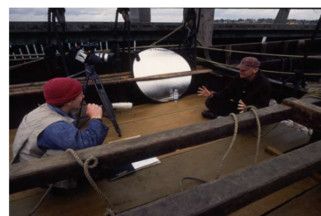
Interview at Roskilde Viking Ship Museum.

Capture, Presentation and Referencing of Video Interviews, for shared reflective practice, including workshop of on-the-road use of photography, film and audio devices.