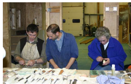
Shetland whittling workshop.