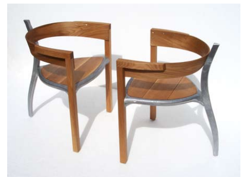
PhD project chairs.

The project is a scholarly display of makers' knowledge: the process is shared democratically among peers; the decisions that articulate design and methods of making are reviewed; and inter-subjective outcomes are generated. To facilitate learning from designer/maker practice-based research, the creative narrative is necessarily articulated through visual media and artifacts.