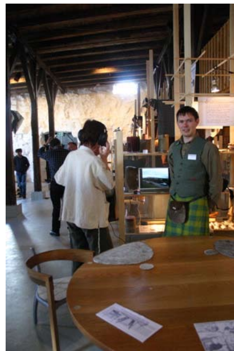
Exhibition in the Faroe Isles.

Having completed the project the author is inspired to continue developing his skills at initiating projects to work in partnership with makers from different disciplines, and in reinterpreting traditional making skills in his own work.