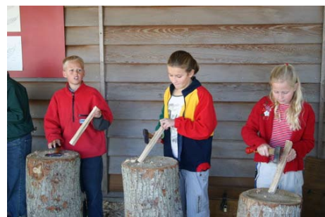
Axe work at Roskilda.