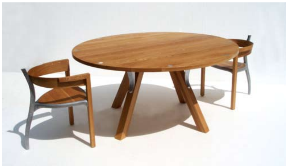
PhD project table and chairs made collaboratively with Icelandic craft practitioners.

The project successfully develops a contemporary reinterpretation of indigenous Icelandic craft-making knowledge and demonstrates this through the making of artefacts imbued with recognized cultural status. It also extends furniture designer/maker research by developing an innovative practice-based method of collaboration rooted in the multimedia archiving